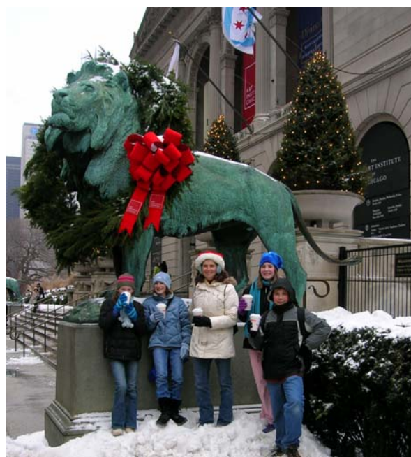
The Junior High Youth Group travelled to Chicago in December for an afternoon of ice skating .