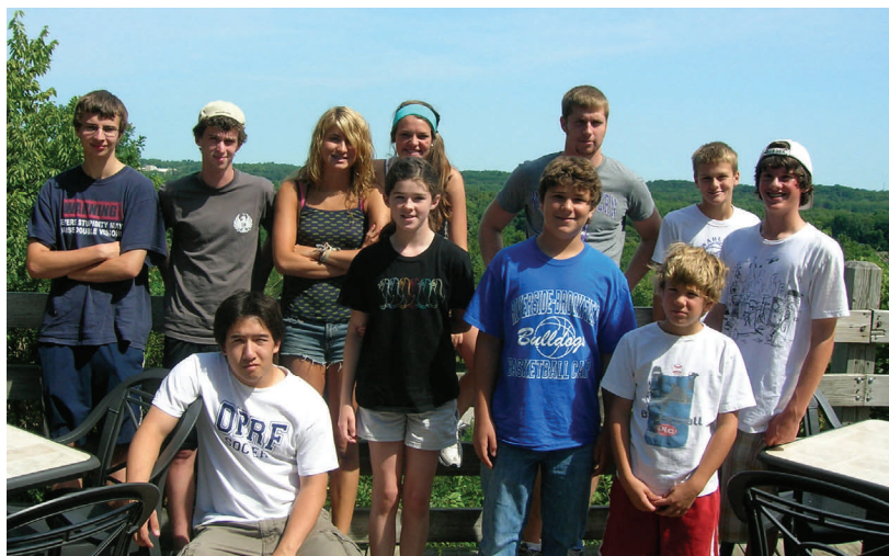
In August members of the youth group hiked at Starved Rock State Park.