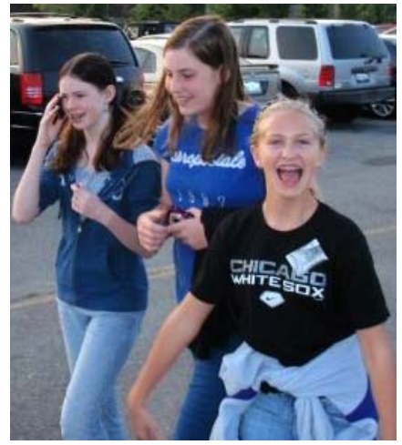
RPC Youth Groups enjoying a White Sox game.