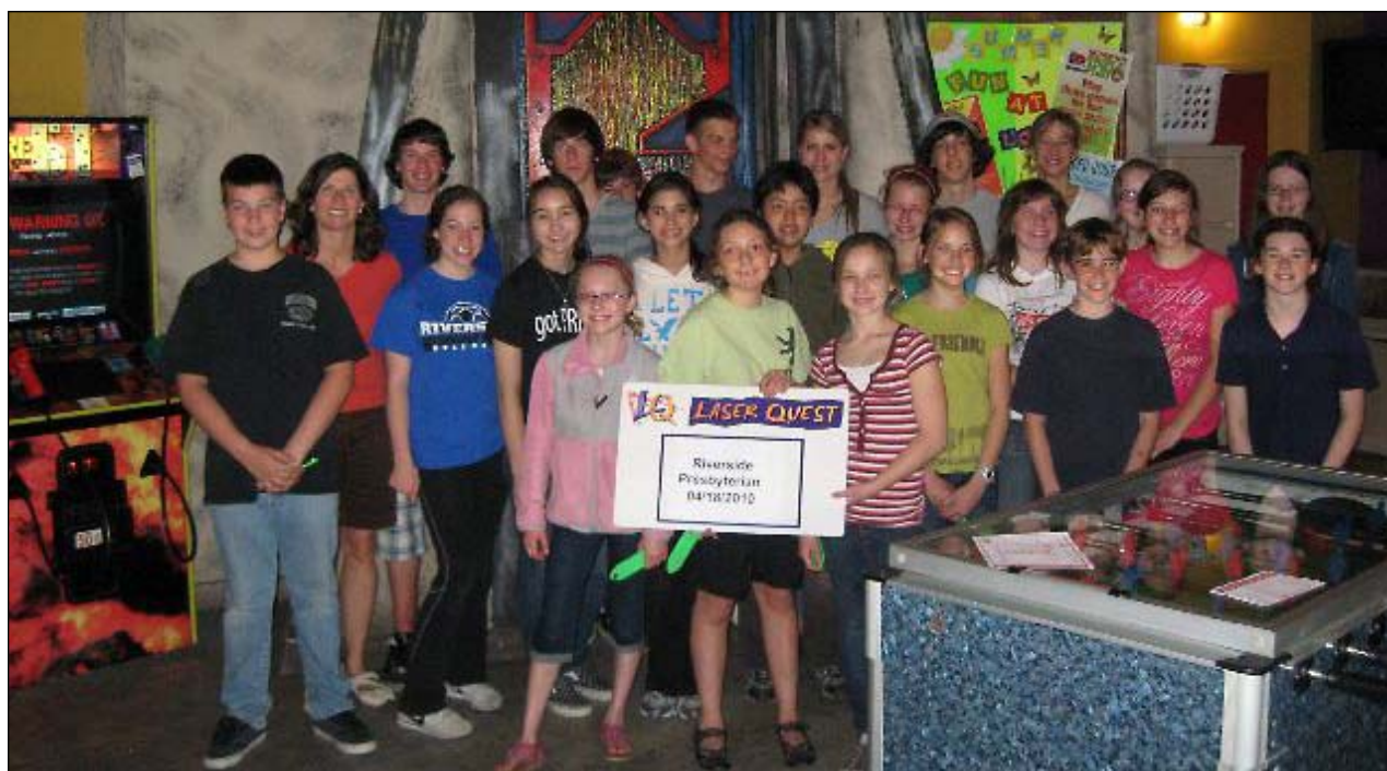
RPC Youth Groups visited Laser Quest in April.

On Saturday, May 29, from 9:00 a.m. to 1:00 p.m., there will be a car wash in the St. Mary parking lot to raise funds for the youth group's mission trip to New York in July. Cars will cost $5 and SUVs/Vans will cost $10. You will be able to enter the parking lot from both Burlington and Herrick. Get your car cleaned and support a good cause at the same time. We hope to see you there!