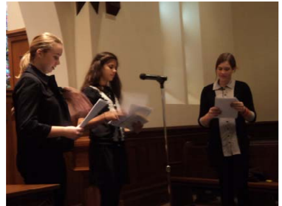
The Girls' Group participated in the November 21 worship service.