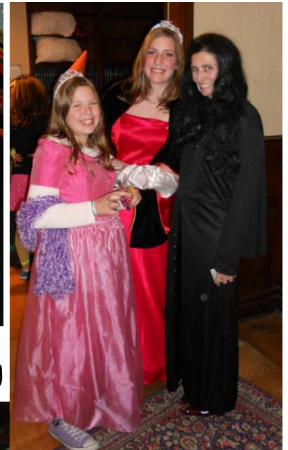
Youth Group Halloween Party