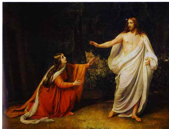
Appearance of Christ to Mary Magdalene by Alexander Ivanov, 1835