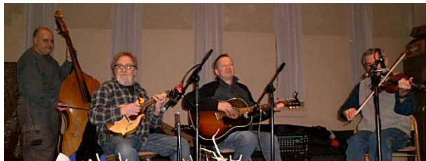
On February 11, RPC members enjoyed a dinner and square dance with the music of the Prairie Shufflers . Thank you to the Girls' Group, who helped decorate the Social Hall and the Gymnasium for the Square Dance. Your help was greatly appreciated. The set-up looked amazing!!