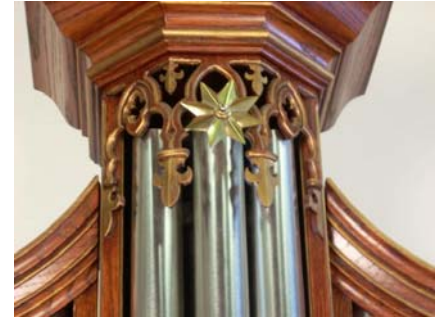
An example of a Zimbelstern.