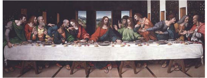
The Last Supper , ca. 1520, by Giampietrino (Giovanni Pietro Rizzoli), after Leonardo da Vinci

During this brief but meaningful rotation we'll be exploring the Last Supper in Sunday School. We'll spend time looking at Communion traditions in our congregation to help children connect important Biblical stories to their lives today. They'll also have a chance to experience the Last Supper through art and by sharing a Seder meal together.