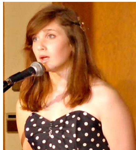
A few of the talented performers from the 2012 show.