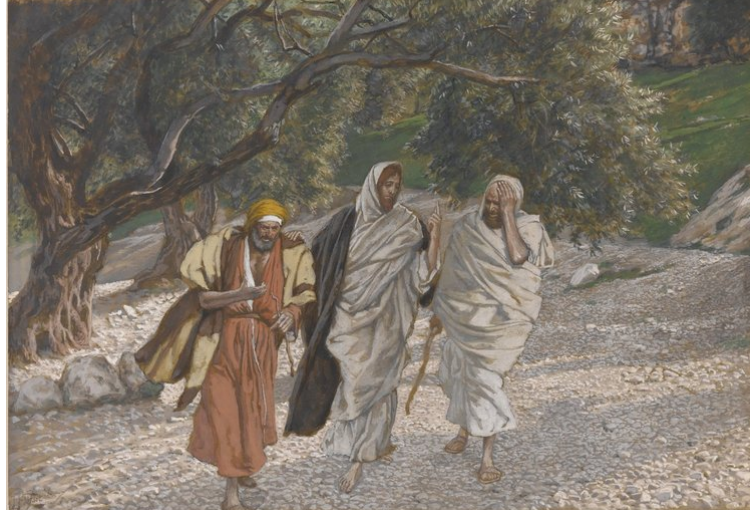
The Pilgrims of Emmaus on the Road by James Tissot 1886-1894

This month in Sunday school kids will learn about the appearance of Jesus to two men on the road to Emmaus. The men did not recognize Jesus at first. It was not until He went home with them and broke bread in a manner similar to that of the last supper that they recognized Him. This story will be explored by experimenting with optical illusions in Celestial Cinema, discussing how various faiths view life after death while making sympathy cards in Creation Station, working in the Living Waters computer lab and hearing a first hand account of one of those who walked with Jesus on the road to Emmaus while creating a weaving project in Oasis Place. Let our eyes always be open to recognize Jesus!