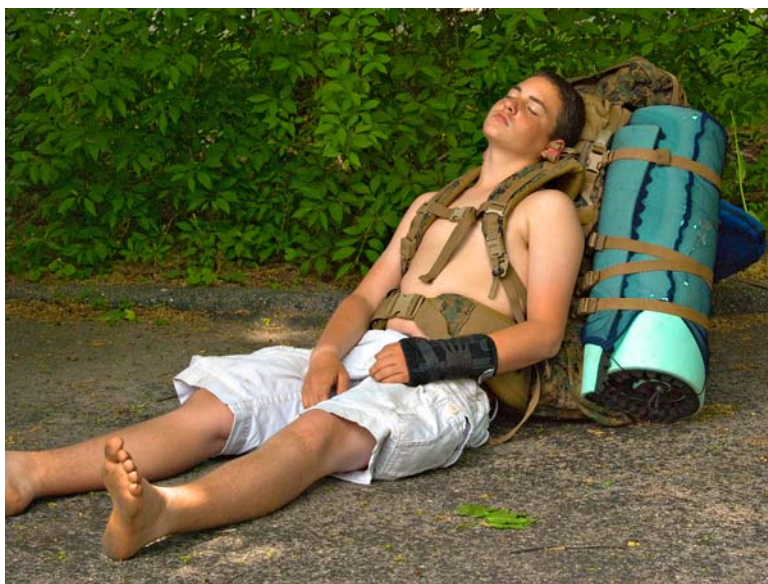
Scouts enjoying, and recovering from, an outing.