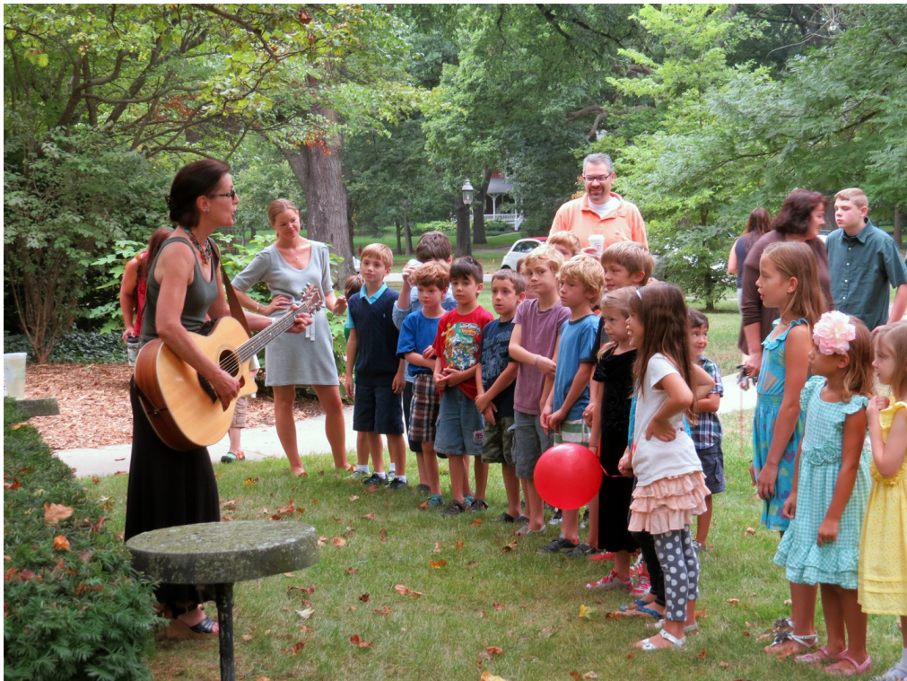
Scenes from Sunday School Kick-off on September 8.