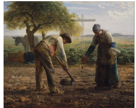
Adapted from Jean-François Millet's Potato Planters , circa 1861