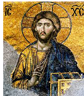
Jesus from the Hagia Sophia