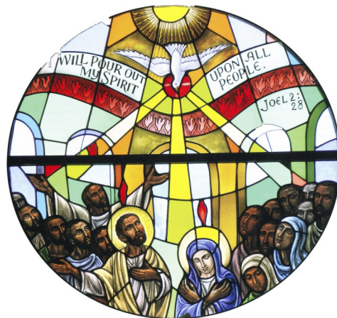
The Holy Spirit St. Peter the Apostle Church Parsippany, New Jersey